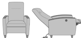
VLRC2 31W 36D 43H 26AH 66 Ext. Depth