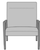
VLDFIXB34P 34W 27D 43H 26AH