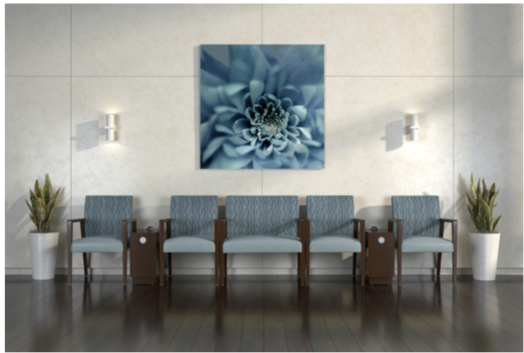
Model: VLDFIXB34G (Also displayed with 4 VLDFIXG11 and 2 BFSDTBLA111.)

Kwalu's Valdina Bariatric chair redefines comfort and style for every lounge, lobby or waiting room guest. Built for maximum stability and strength, utilizing our steel reinforced joint system, this thoughtfully designed chair accommodates generous proportions and is available in two back heights. The chair back extends to the seat rail and the cleanout is incorporated behind the seat cushion providing a clean, functional look.