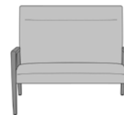
VLDFIXB46P 46W 27D 43H 26AH