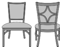
TOR102 25W 26.5D 38H