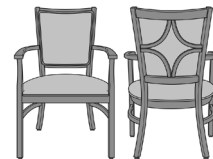
TOR112 25W 26.5D 38H 26.5AH