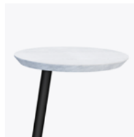
Table features a 1" solid surface top with elliptical edge detailing.