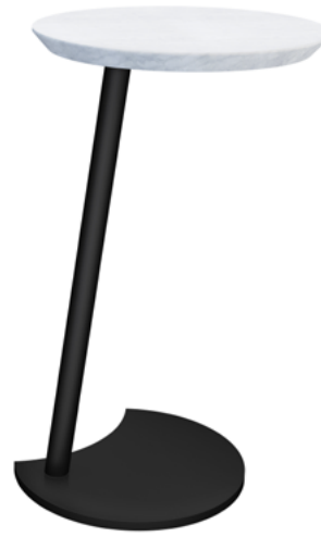
Model: TZCTBLA211 15W 14D 23.5H 14 Top Diameter 12 Base Diameter

Enjoy the convenience and versatility of Kwalu's Terzo Cantilever Tables. These nesting angled tables feature 1" thick solid surface tops and powdered coated bases with a number of optional colors from which to choose. There are two sizes, a large and a small, with the smaller shorter table fitting slightly below the larger taller version. Sold separately, the Terzo tables' angle of the single leg allows positioning close to the user.