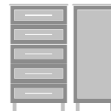
TECH50 25W 19D 46.75H