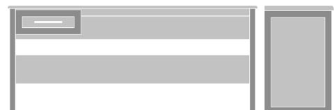
TEDK103R 69W 19.5D 30H