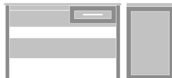
TEDK102R 45.25W 19.5D 30H