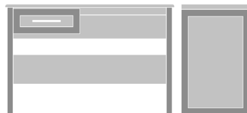
TEDK102L 45.25W 19.5D 30H