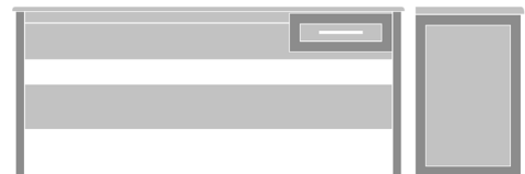
TEDK103L 69W 19.5D 30H