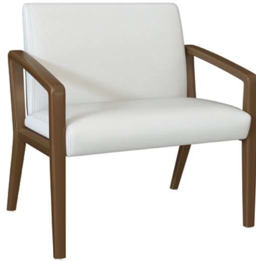
Model: MDAB34G 34W 27D 35H 29.5SW 18.5SD 19SH 26AH

The cushioned seat of the Modena Bariatric – 34W extends slightly to support and deliver more comfort to thighs and behind the knees. Reinforced steel under the seat supports 500 pounds. The flex frame connects from the seat of the chair to the back and consists of three custom brackets and horizontal support. The seat, arms and legs remain stationary to deliver ergonomic support as the user changes position while seating. The Modena Guest chairs are suitable for multiple healthcare locations including patient rooms.