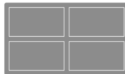
MIHBT 42W 1D 24H