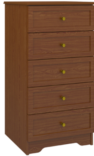
Model: LACH50 25W 19D 46.75H

The Lancaster Collection offers unobtrusive refinement and skilled craftsmanship to form the perfect balance between function and beauty. Rich OG detailing on the tops and recessed insert panels set into chamfered frames on doors and drawers. Collection available with or without contrasting edges as well as custom color combinations.