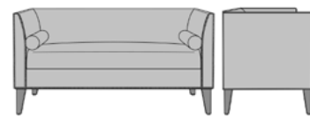
FALBB021 52W 25D 30H 30AH