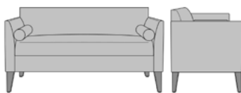
FALBA001 52W 25D 30H 26AH