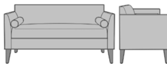
FALBA111 52W 25D 30H 26AH