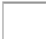
FWWD00 25W 24.5D 71H