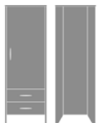
EXWR21R 23.75W 23D 71H