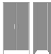
EXWR02 34.75W 23D 71H