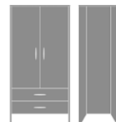
EXWR22 34.75W 23D 71H