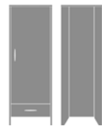
EXWR11R 23.75W 23D 71H