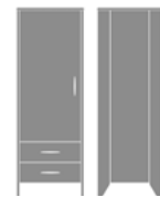
EXWR21L 23.75W 23D 71H