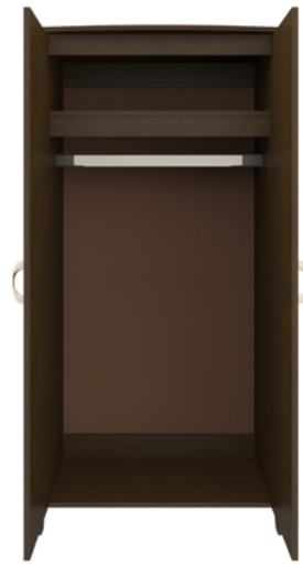
Model: EXWR02 34.75W 23D 71H

The contemporary Essex collection features a distinctive leg design providing a dimensional look that allows for easy cleaning. Select tone-on-tone or contrasting wood-grained finishes for legs and top. Customizable and available in a variety of sizes. Sophisticated hardware delivers added style.