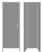
EXWR01L 23.75W 23D 71H