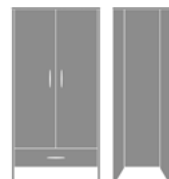
EXWR12 34.75W 23D 71H