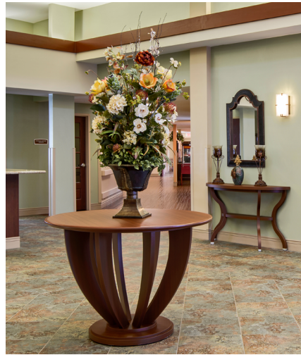
Model: DRE01 (Also displayed with VTTBLD1A)

Kwalu's Dorgali Entry Table will make a grand first impression. Tulip style legs create an open and airy feeling. Dorgali comes with a standard Kwalu Fusion top featuring elliptical edge banding. Two sizes to choose from, the Dorgali is 60" in diameter; a 48" version is optional. If you'd like, this table will accommodate an additional custom granite top of your choice.