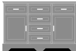
DOBF62S48 48W 18D 32H