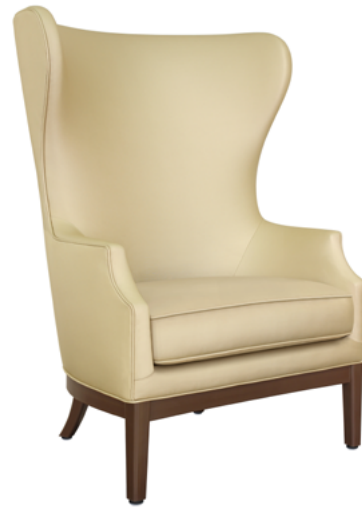
Model: DR111 32.5W 34D 48H 26.5SW 19SD 19.5SH 25AH

The Dirillo Lounge Chair is not shy and retiring. An angled back with rounded wings and sculpted arms create an elegant, bold and modern silhouette. Piping is standard styling on the seat cushion and base. The extremely comfortable spring seat cushion is removable for easy cleaning.