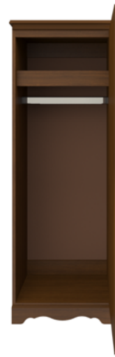
Model: CHWR01R 25W 23.75D 71H

The Charlotte Collection is the perfect fit for any traditional senior living environment. Gently radiused corners and OG edging protects fragile skin, while the styling uplifts and restores the spirit. Raised cabinetry promises ease of cleaning below case goods.