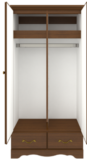
Model: CHALZ 34.5W 23.75D 71H

Kwalu's Charlotte Dementia/Alzheimers Wardrobes are thoughtfully designed to support resident independence and safety. Hidden door latches and passive locks allow caregivers exclusive access. Light colored interiors help with spatial orientation. The interiors feature a lighter color finish to increase visibility of the contents.