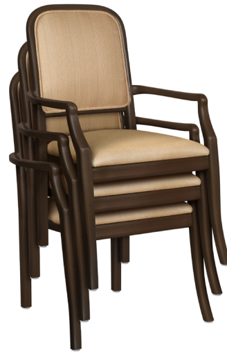
Model: STK2094 (Also displayed with 2 additional STK2094. Not included.)

Transitional in its styling, the Stacking collection combines classic elegance with unexpected durability and comes with a wide variety of designs and detailing options. These chairs nest three high.